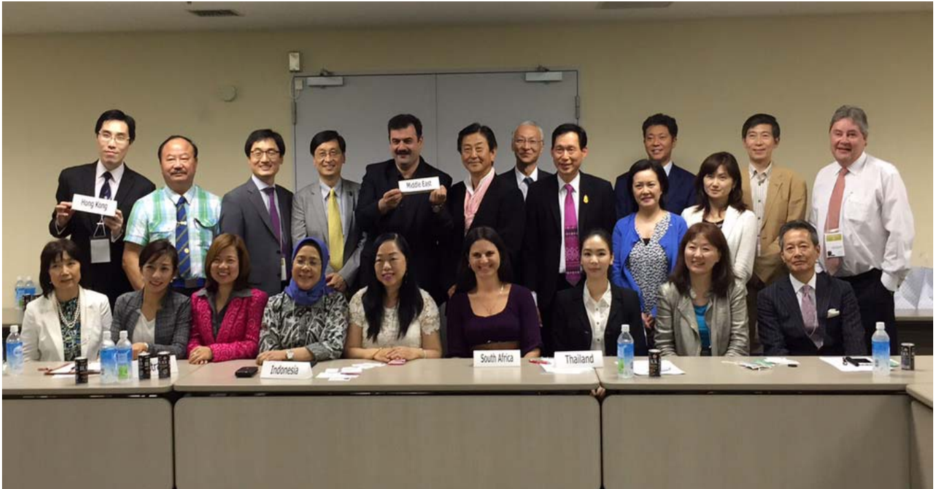
Attendees of the Zone 2 Meeting

Conference and matters related to IFSCC. The next Meeting will be held in September during the IFSCC Conference in Zurich Switzerland.