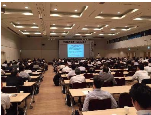
A glimpse of the General Meeting

IFSCC Congress in 2020. A preparatory committee will be set up to plan a meaningful Congress to all cosmetic scientists worldwide. Please look forward to 2020.