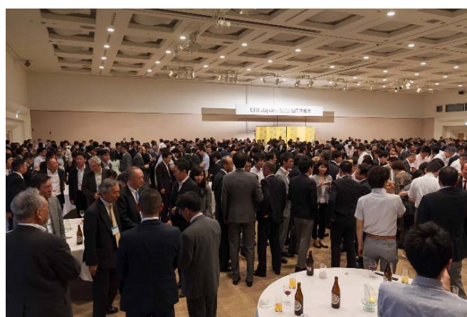
A scene at the get-together