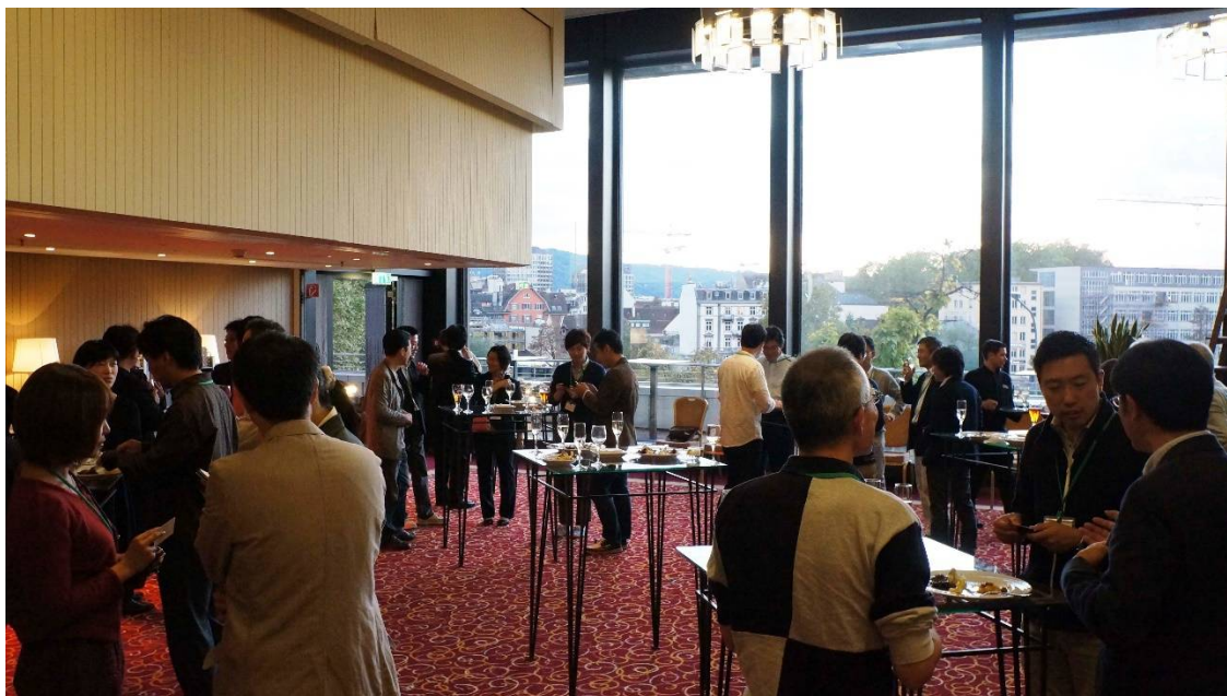
Team-forming ceremony in Zurich

A departing ceremony was held at Narita Airport from where we left Japan, and once we reached our destination, Zurich, a team-forming ceremony was conducted prior to the Conference for members to become acquainted with each other and to wish the presenters the best of luck.